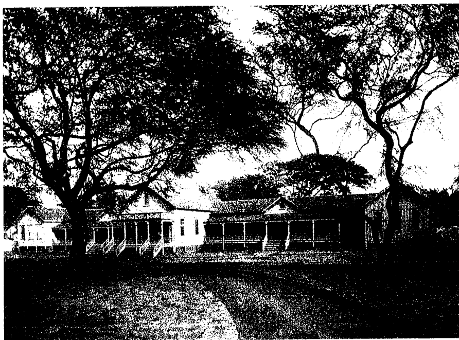
Ke Kula Kahunapule o ka Pakipika Akau (The North Pacific Missionary Institute) trained Native Hawaiians for the pastorate in Hawai‘i and Micronesia from 1877 to 1908. The building pictured was constructed in 1890 to house the school and was located on Punchbowl Street near Beretania in downtown Honolulu.

Although the re-organized North Pacific Missionary Institute would produce forty-four Native pastors by the end of the century,